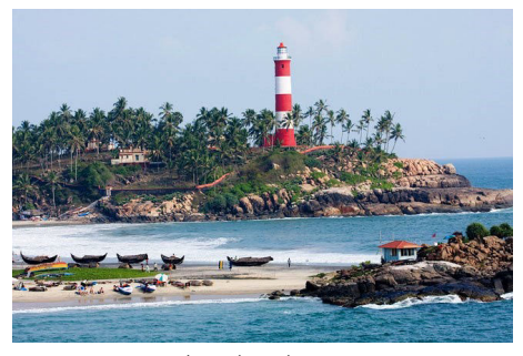
Alappuzha Light House