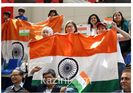
SVCC Participates in the Celebration of the Day of Unity at Arkalyk