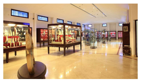
RRK Memorial Museum