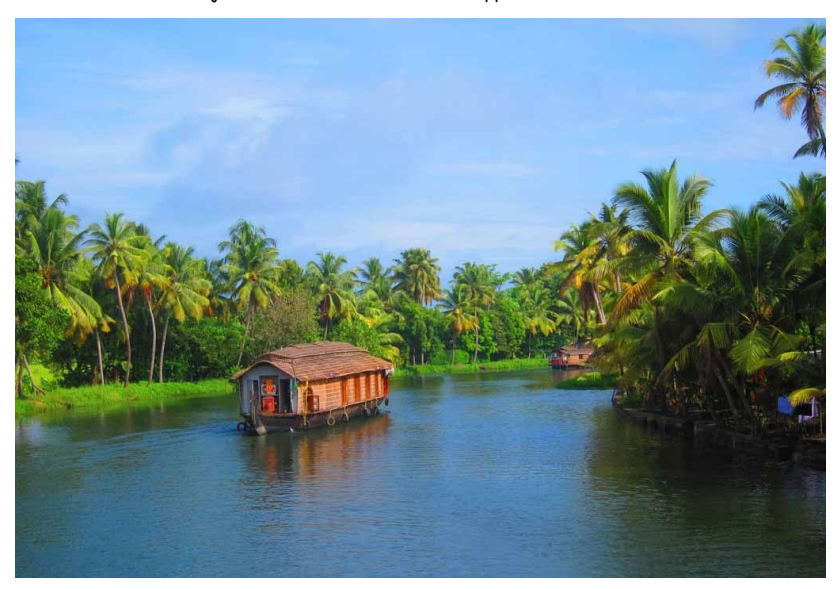
Houseboat in the Backwaters of Alappuzha

Karimadi Kuttan, a 9th century black granite statue of the Buddha in Karumady; Marari Beach; and St. Andrew's Basilica constructed in the 16th century in Arthunkal are some of the other major tourist attractions near Alappuzha.