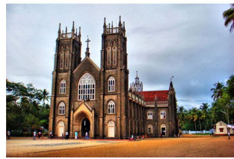
St. Andrew's Basilica in Arthunkal