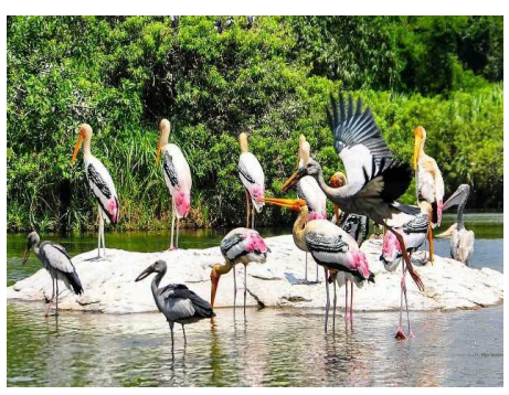
Kumarakom Bird Sanctuary